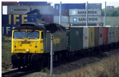
SW Cambridgeshire in 2025?

There is a risk of permanent disruption to the lives of South West Cambridgeshire residents due to the planned rail link, literally driving a wedge between our local communities.